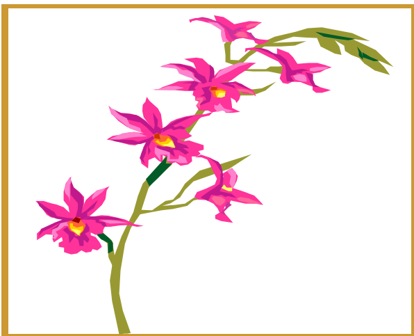
Volume 19 Issue 3