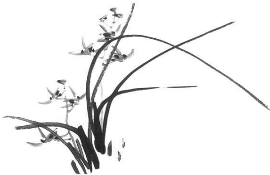
Volume 19 Issue 3