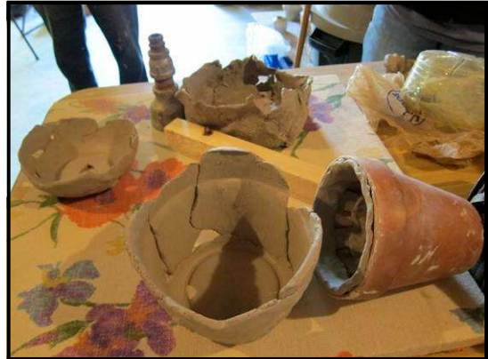
Unfired pottery, or greenware. Wow, be careful, it's fragile!