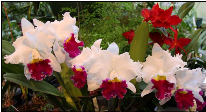
Trophy Winning Cattleya Orglade's Grand