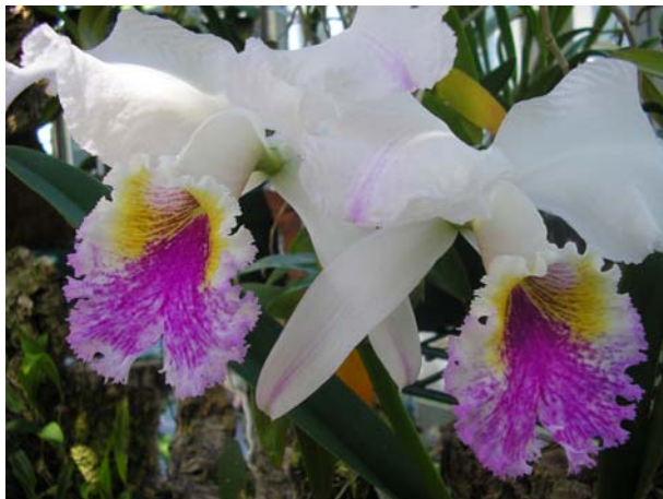
Volume 15 Issue 5