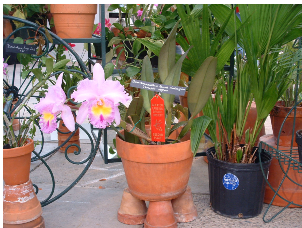
Neal's BLC Pamela Hetherington 'Coronation' at the GLOS show