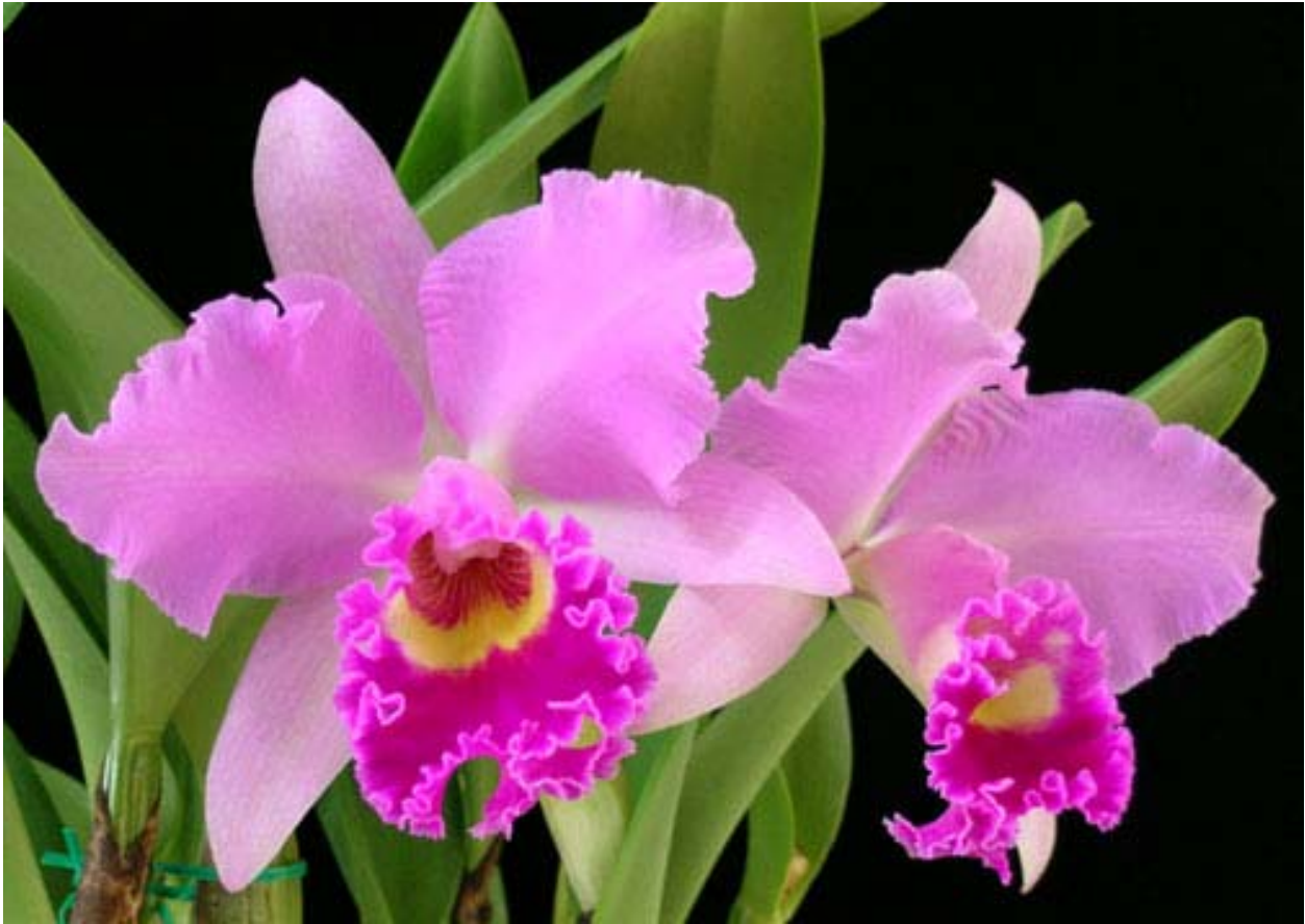
Blc. Meditation 'Kings Ransom' x Slc. Red Princess

This is a nice cross that blooms every November. Purchased from Summerfield Orchids a few years ago and it just keeps on growing and I keep dividing it and it rewards me with these pretty blooms every year.