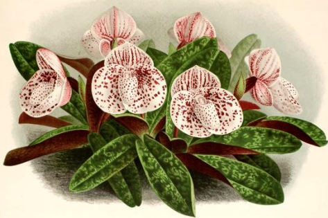
CYMBIDIUM BELLATULUM WOOD.